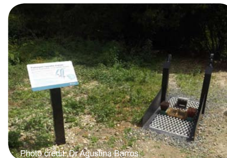
Figure 2: Pathogen control stations in Springbrook National Park, Queensland, Australia.

These and other similar practices can be incorporated into minimum impact codes such as walking guides and educational materials for conservation areas. Examples could include visual material such as posters, notices or brochures at flight centres and visitor centres, park entry points and airports as well as internet based materials. They should be clear, specific and describe positive social norms because people are easily influenced by what seems to be other people's normal behaviour.