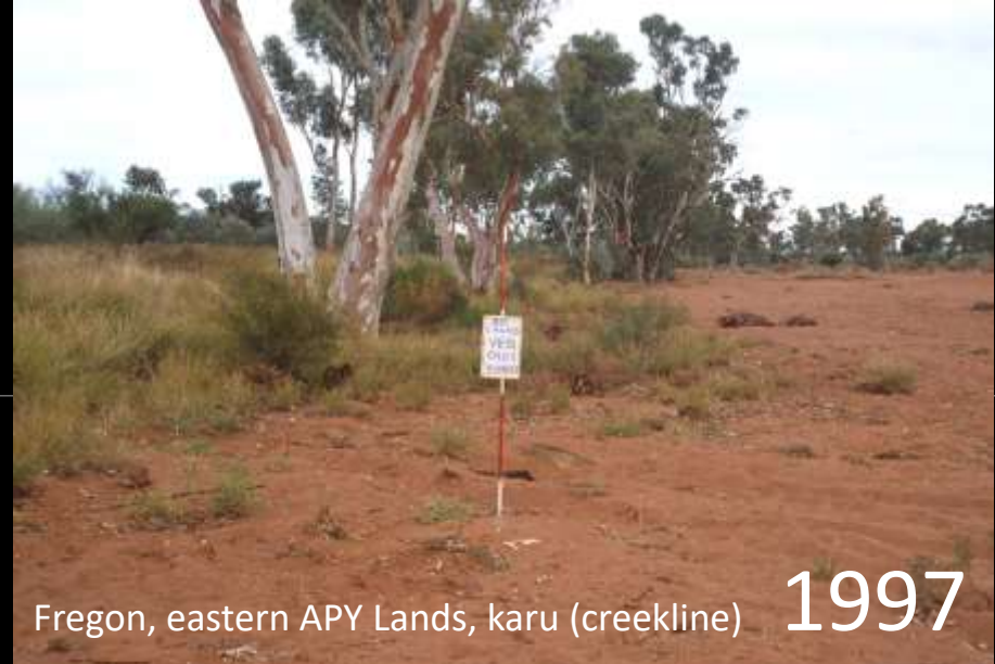
Fregon, eastern APY Lands, karu (creekline) 1997