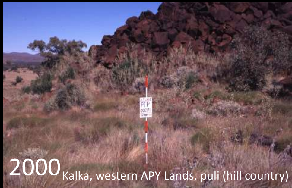
2000 Kalka, western APY Lands, puli (hill country)